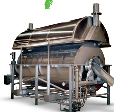
BLANCHER COOKER / COOLER