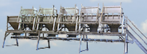
Vegetable Distribution System